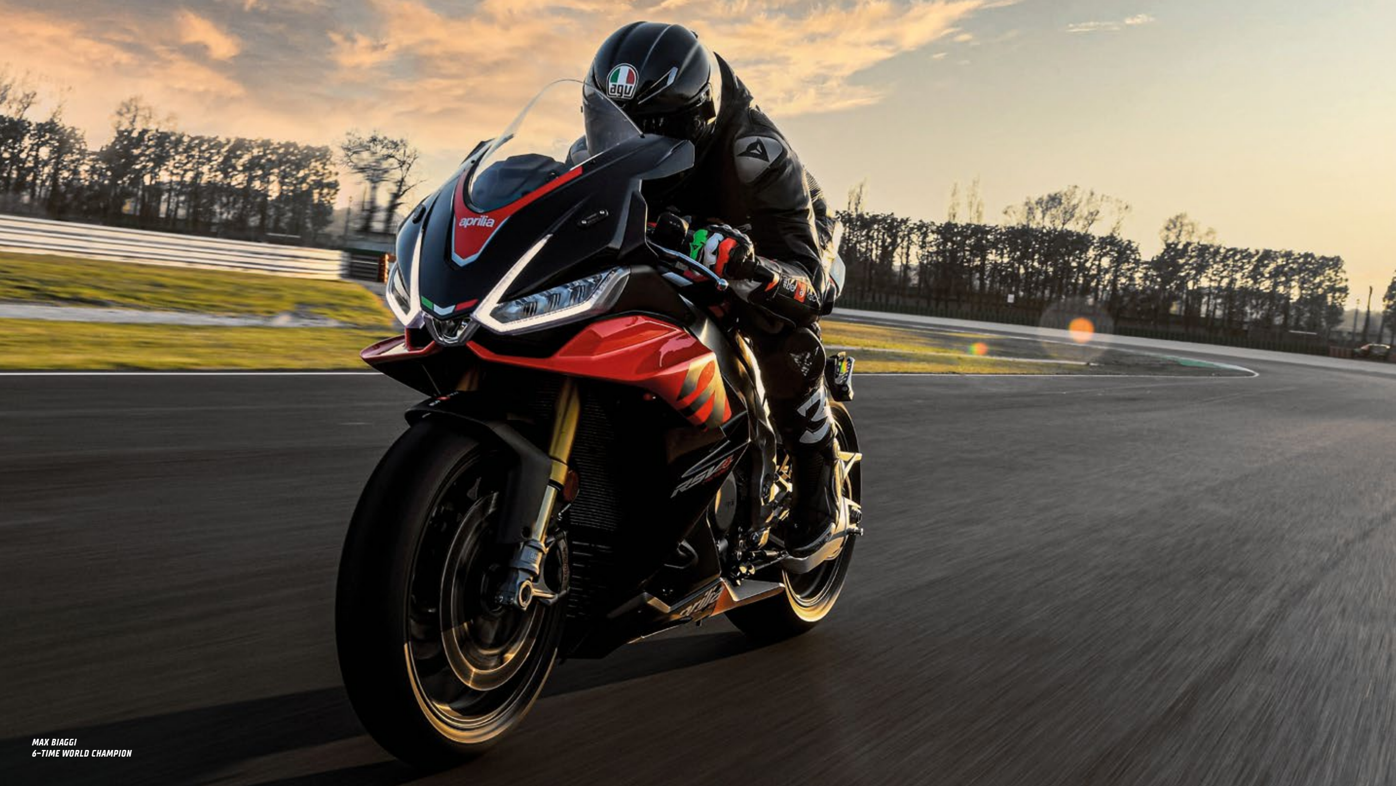
MAX BIAGGI 6-TIME WORLD CHAMPION