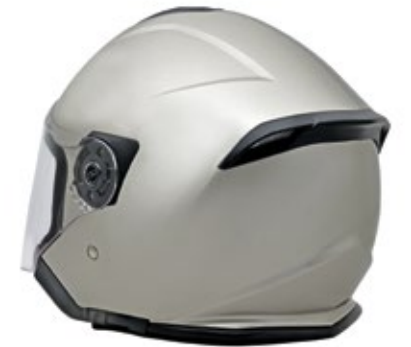
▲ PFJ HELMET ○ ● ●