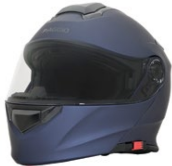
▲ MODULAR HELMET ○ ● ●