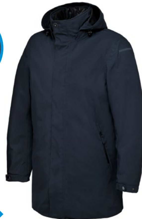
WATERPROOF PARKA JACKET