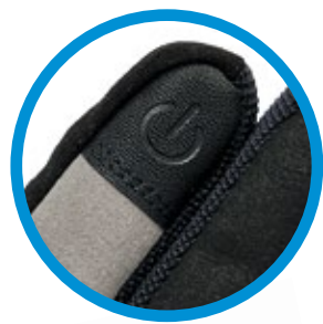
SHORT TOUCH-SENSITIVE GLOVES