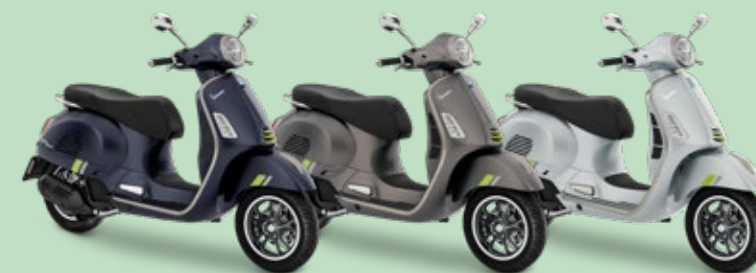
BLU ENERGICO OPACO