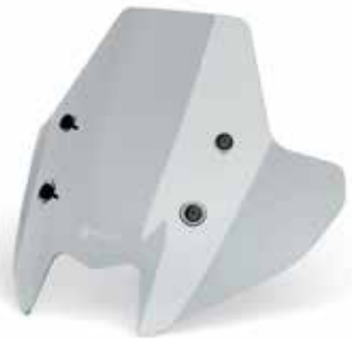
BLACK SPORT FLYSCREEN