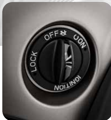
NEW KEYLESS SYSTEM