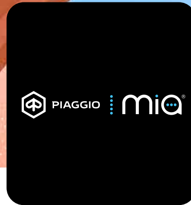
ADVANCED CONNECTIVITY WITH PIAGGIO MIA ON BOARD