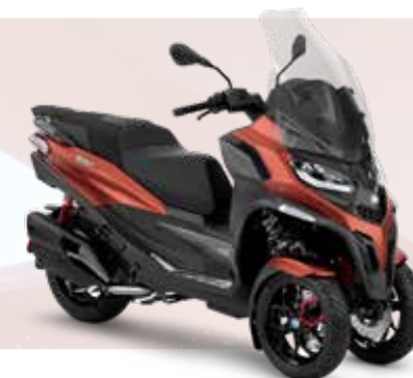
ARANCIO SUNSET MATT