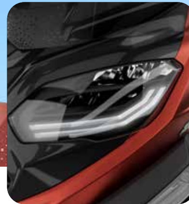
NEW LED DRL HEADLIGHTS