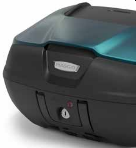
TOP BOX 52 l