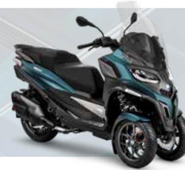
BLU OXYGEN MATT