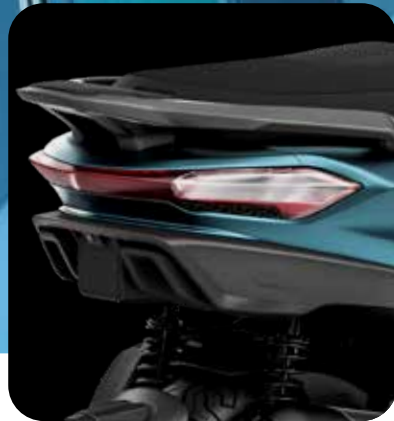
NEW DESIGN WITH ULTRAMODERN DESIGNS