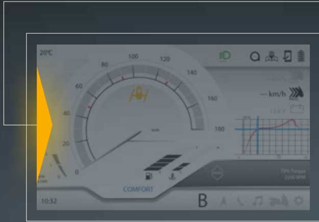
BLIS - BLIND SPOT INFORMATION SYSTEM