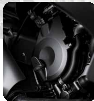
EURO 5 ENGINE