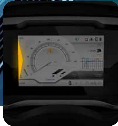
BLIND SPOT INFORMATION SYSTEM