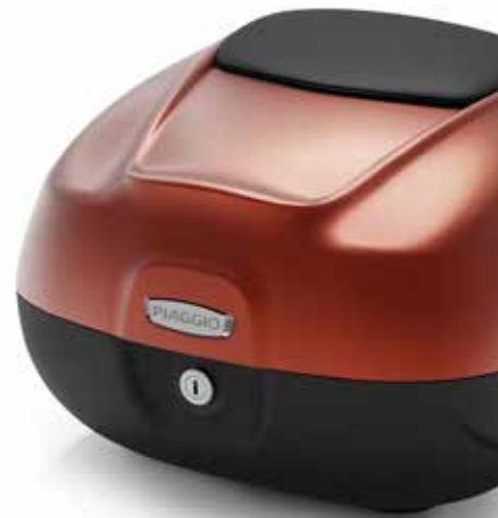
TOP BOX 37 l