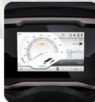
DASHBOARD WITH 7" TFT DIGITAL DISPLAY