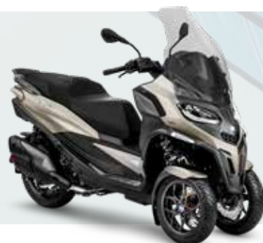
GRIGIO CLOUD MATT