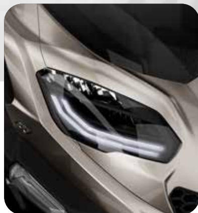
FULL LED LIGHTING SYSTEM