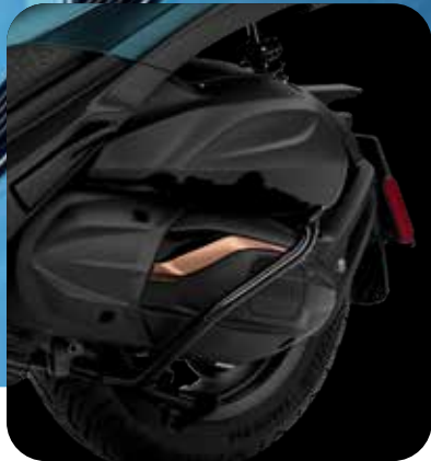
NEW 530 CC EURO 5 ENGINE