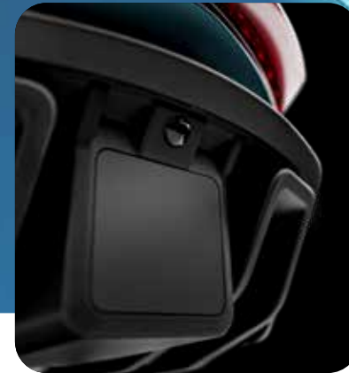
REVERSE DRIVING WITH REAR CAMERA